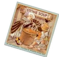
Nutrition Education with Stone Soup story