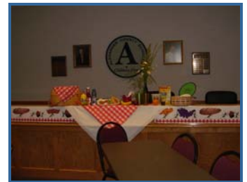
Alexander School Health Advisory Council Meeting